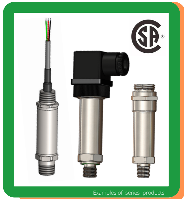
Examples of series products