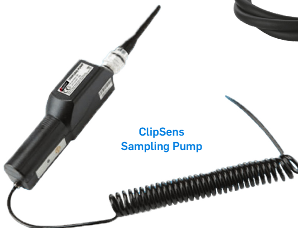
ClipSens Sampling Pump