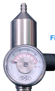
Fixed Flow Regulator