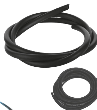
Last-O-More Gas Sampling Hose